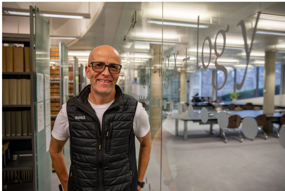
Timothy Kisler Green Centre for Mathematical Sciences, School of the Physical Sciences