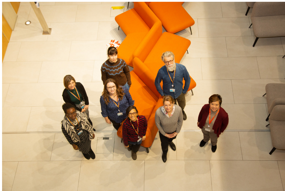
The University Counselling Service Other Council Non-School Institutions