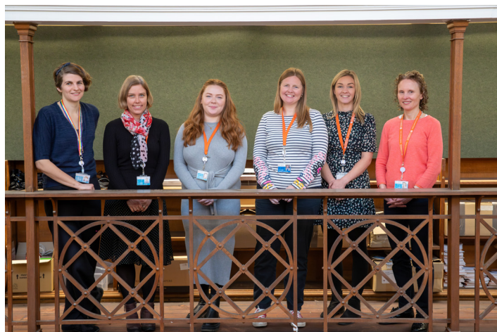
Financial Assistance Team Student Admissions and Access, Education Services