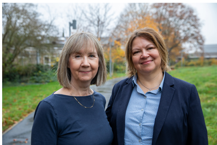
Governance and Ethics Administrators Department of Public Health and Primary Care