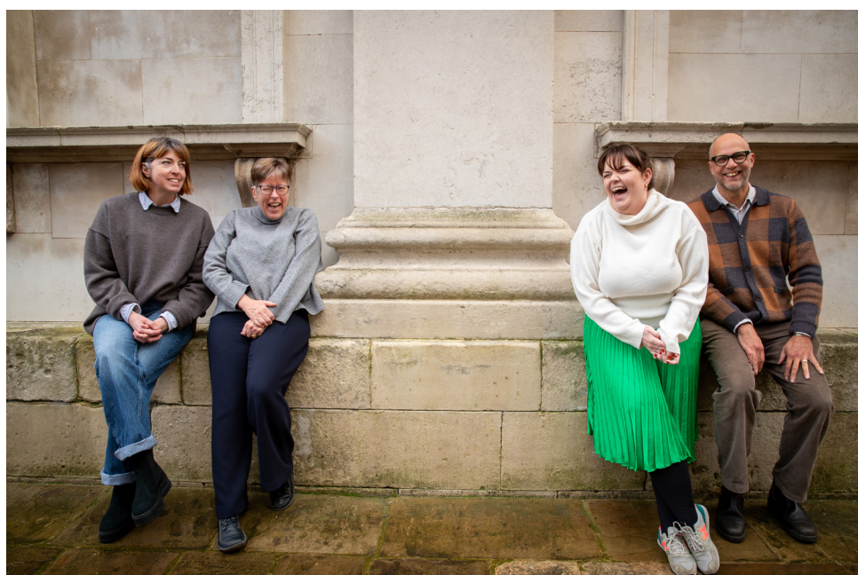
Public Engagement Team - Festival Office of External Affairs and Communications