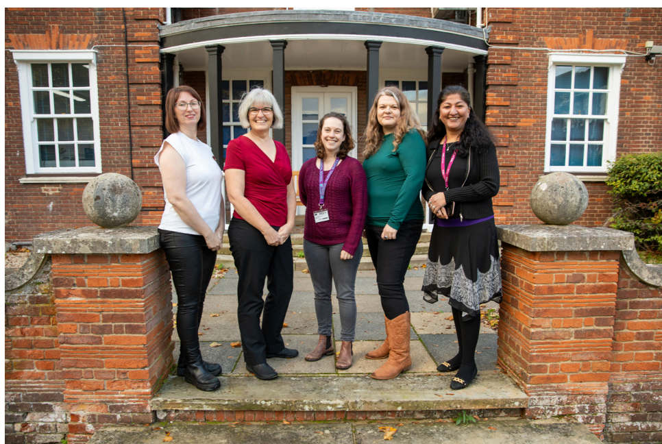
THIS Institute fellowship and operations team Department of Public Health and Primary Care, School of Clinical Medicine