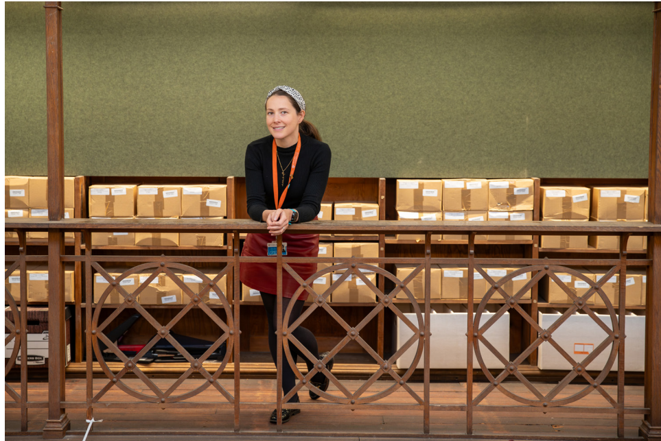
Jennie Clayton Education Services